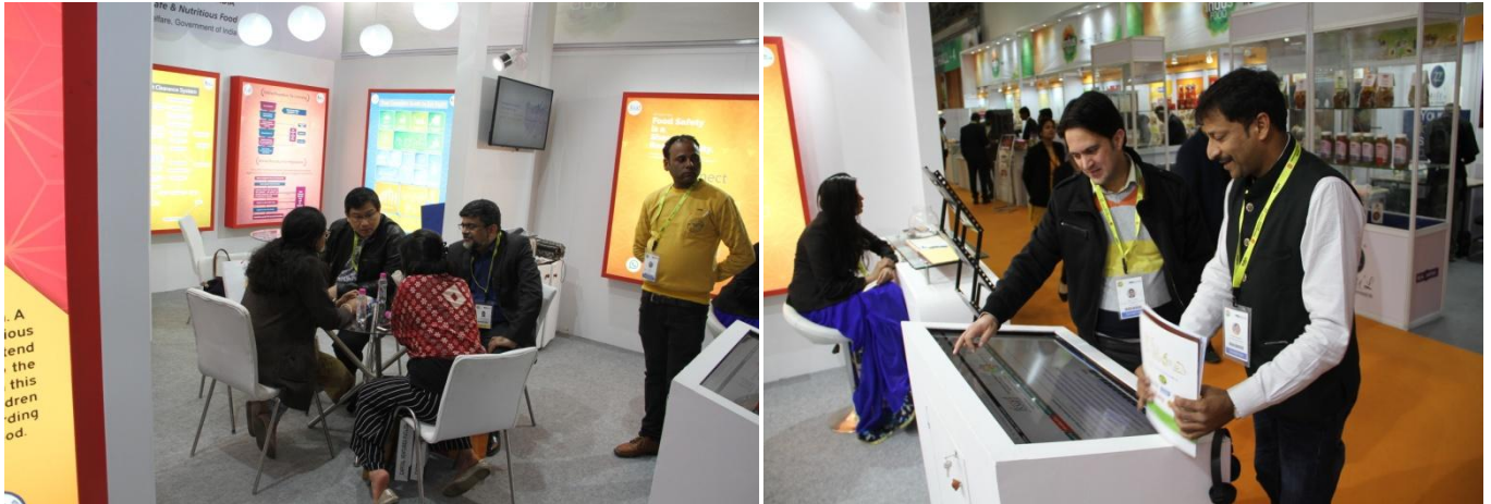
Queries of visitors being addressed.

All the queries were attended with utmost attention by the FSSAI officials with pictures and explanation using touch pads, pamphlets and display boards.