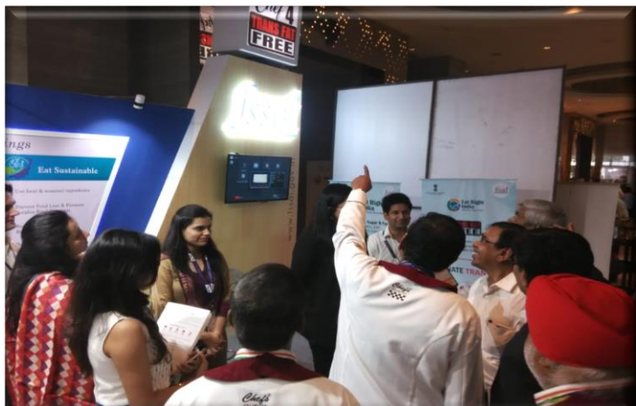
Queries of visitors being addressed