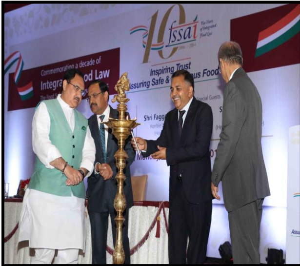
Ceremonial Lamp Lighting at Commemorative event