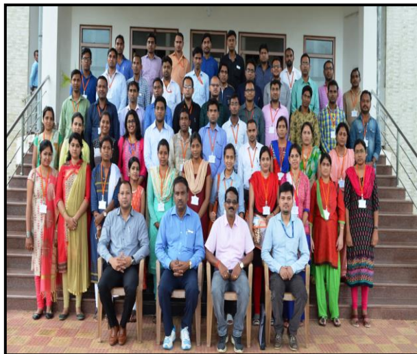
Training programme of Food Safety Officers at Raipur