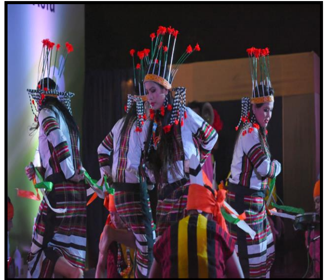
Cultural performance during CCASIA20