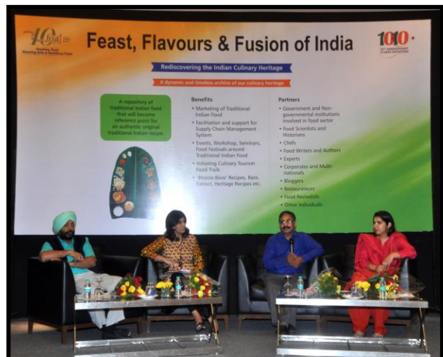
Panel discussion among eminent chefs of India