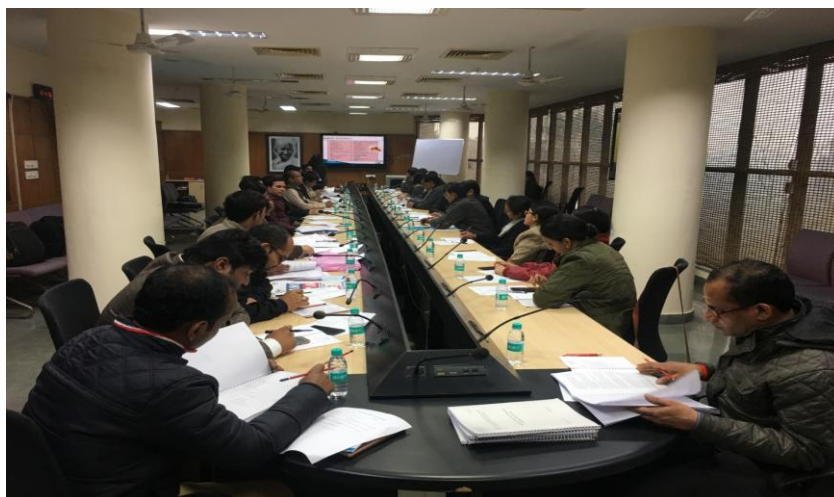
Participants from the Northern Region (states: Delhi, Punjab, U.P, Haryana, Uttarakhand and JK)