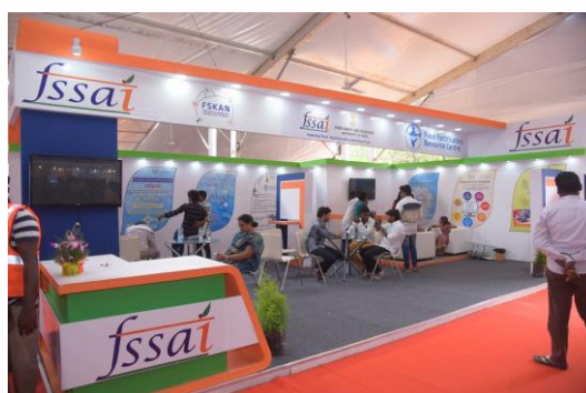
FSSAI Stall at 104 th ISC- PoI Expo

4.4 Food Safety Knowledge Assimilation Network (FSKAN), a new initiative of FSSAI was unveiled by Chief Minister Sh. N. Chandrababu Naidu on 3 rd January, 2017. Sh. N. Chandrababu Naidu appreciated & acknowledged the efforts of FSSAI towards creating a network of scientific cooperation network.