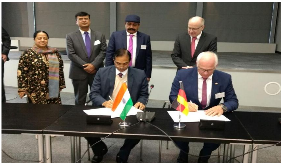
5 th Indo-German JWG in Hannover, Germany