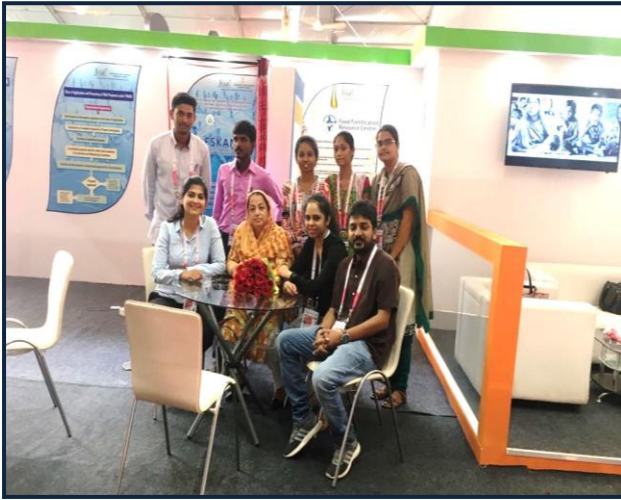
104 th ISC-PoI Expo