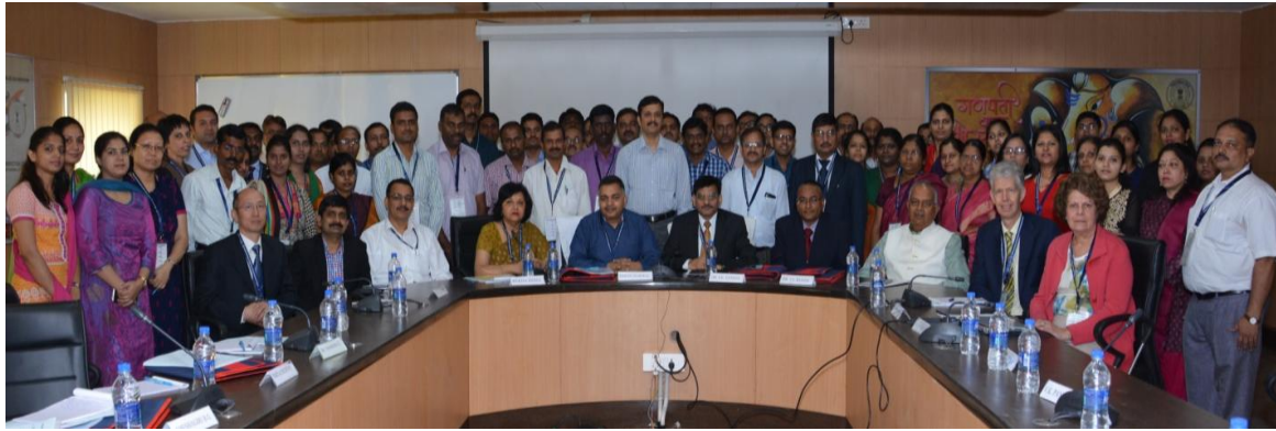
Participants with Dignitries