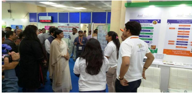
Smt Anupriya Patel, Hon'ble Minister of State for Health and Family Welfare visiting FSSAI Stall