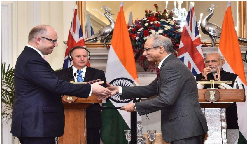
Exchange of Arrangement signed between FSSAI and New Zealand Ministry of Primary Industries at Hyderabad House, New Delhi on 26 th October, 2016

The objective of this Arrangement is to enhance cooperation and alignment of understandings between the Participants so as to better manage risks to human health, while reducing any duplicative or unnecessary food safety related regulation affecting trade between the two countries.