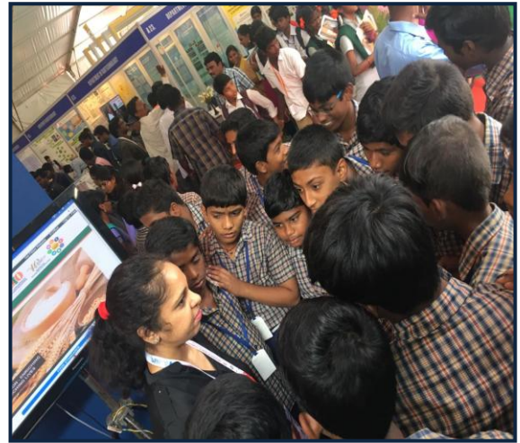
Visitors' queries being addressed at 104 th ISC-PoI Expo