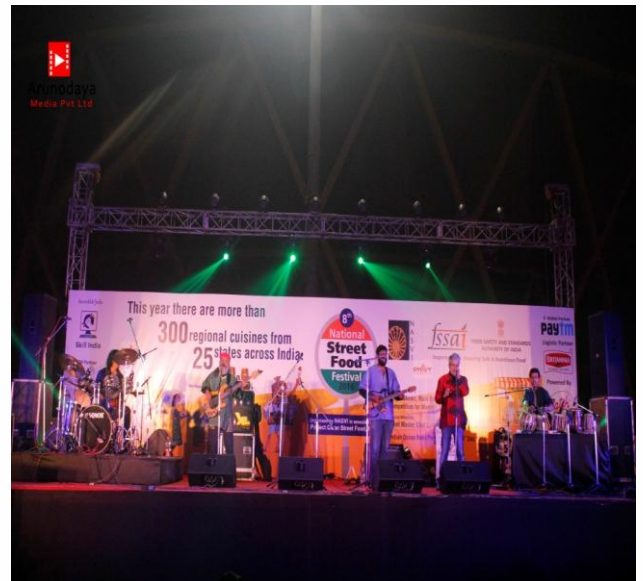
Band Performance at NSSF-2016