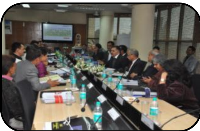
20 th Meeting of the Food Authority