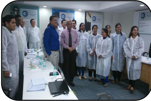
Training Programme of Food Analysts and other Laboratory personnel of State Food testing Laboratories