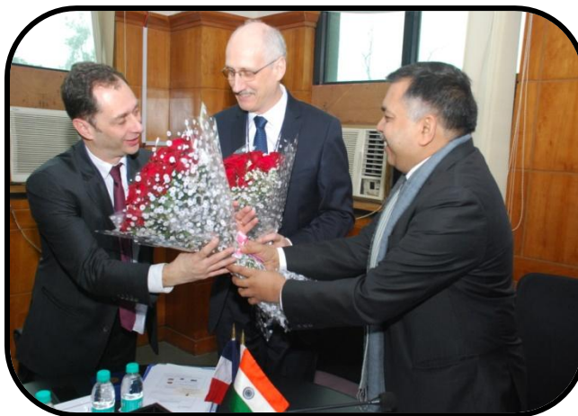
Meeting with Foreign Delegation