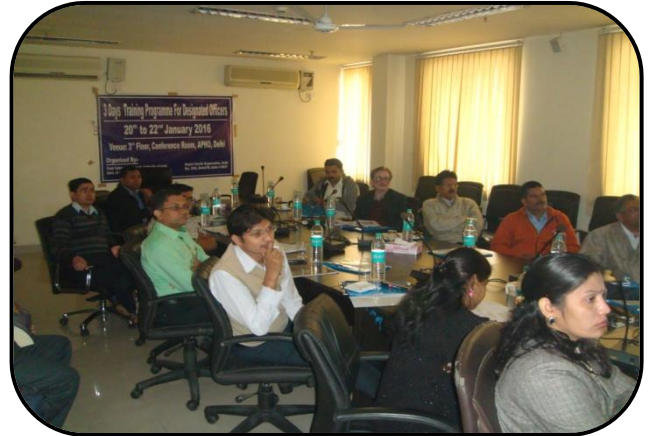
Training of Designated Officers