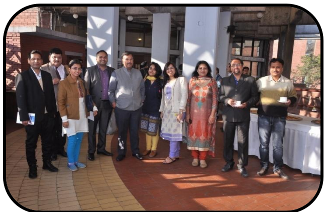
16 th Meeting of the Central Advisory Committee (CAC)