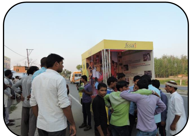
Mass Contact Activation Programme