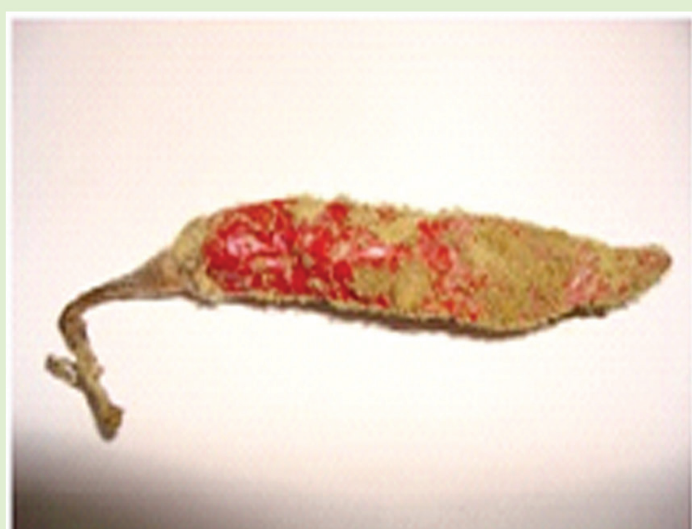
Red whole chilly

Agricultural crops such as maize (corn), groundnuts (peanuts), cottonseed, spices, tree nuts and processed products such as milk and milk products, eggs, peanut butter etc. are more likely to be contaminated with aflatoxins. Aflatoxin contamination in milk and dairy products is also a serious problem, as most of the human beings, particularly infants, are dependent on milk as a part of their diet. Contamination of milk with aflatoxin M1 might occur where mammals ingest aflatoxin B1 contaminated feed, metabolize it in their liver to the hydroxylated metabolite known as 'milk toxin' or aflatoxin M1, which is excreted in their urine and milk. Furthermore, it may subsequently also appear in milk products, such as curd, cheese, and milk powder. The molded and aflatoxin contaminated food commodities are shown below:-