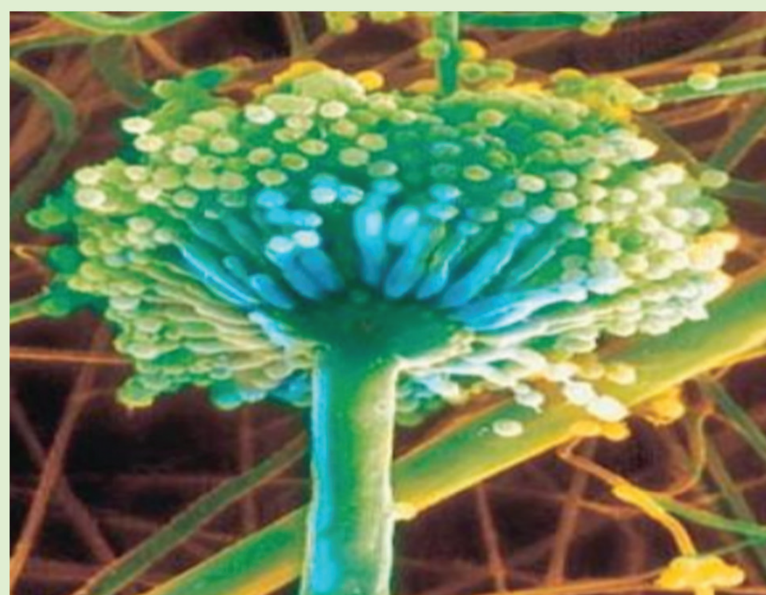
Micrograph of a head of Aspergillus flavus showing spores

Aflatoxins are a class of mycotoxins produced primarily by Aspergillus flavus and Aspergillus parasiticus group of fungi. The spores of these fungi grow on a suitable food substrate under favourable environmental conditions. Nearly 18 different types of aflatoxins have been identified and the major toxins are Aflatoxin B1 (AFB1), B2 (AFB2), G1 (AFG1), G2 (AFG2) and Aflatoxin M1 (AFM1). Both AFB1 and AFM1 are Group 1 carcinogens according to International Agency for Research in Cancer (IARC). Aflatoxins are especially problematic in dry and hot climatic conditions and their prevalence is aggravated in pre-harvest crops by conditions of drought, floods, delayed harvest, pest infestation, inadequate drying including improper postharvest handling and storage of crops and food.