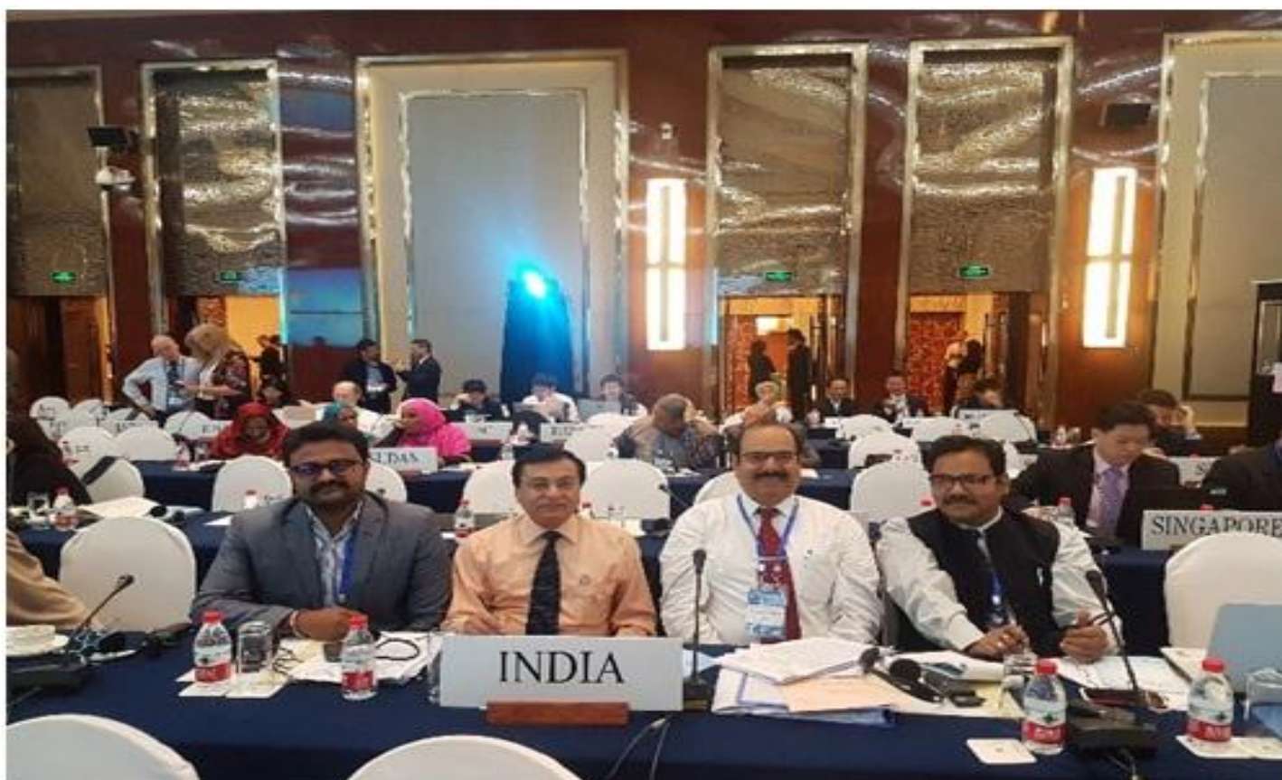
Indian delegation at CCPR49

The Committee will start work on Information on national registration of pesticides Establishment of a Codex database of national registration of pesticides, Review of the IESTI equations (possible revision of the IESTI equations),