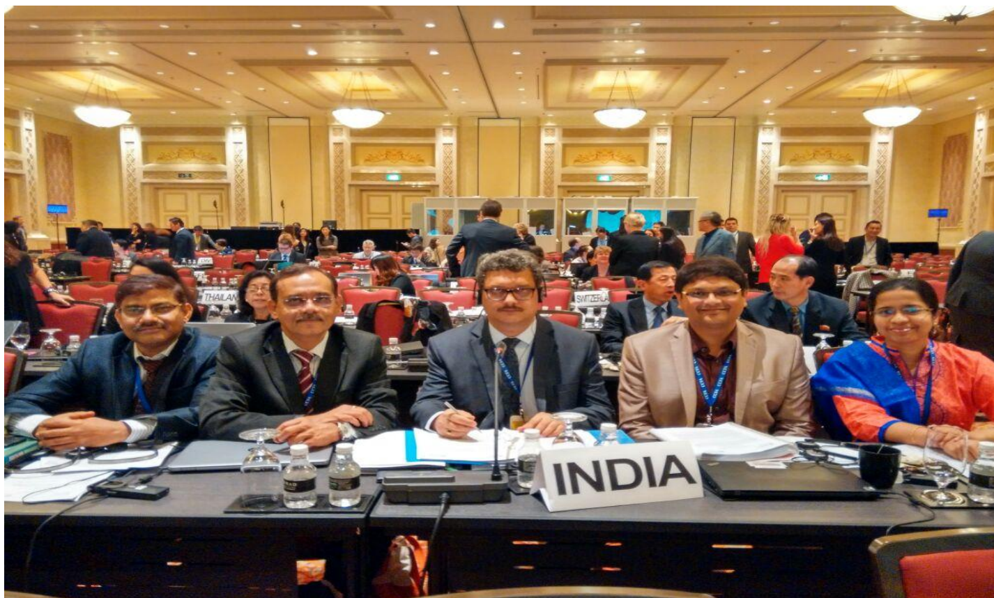
Indian delegation at CCFA49

Discussion on the use of nitrates (INS 251, 252) and nitrites (INS 249, 250), on the use of the terms “unprocessed” and “plain” in the GSFA, and future strategies of GSFA will take place in the next session of CCFA.