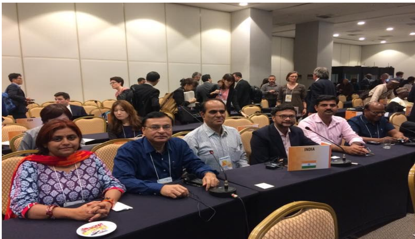
Indian Delegation at CCCF11

Discussion on Structured approach to prioritize commodities not in the GSCTFF for which new MLs for lead could be established, Aflatoxins and sterigmatocystin in cereals, Development of a Code of practice for the prevention and reduction of cadmium contamination in cocoa will take place in the next session of CCFA.