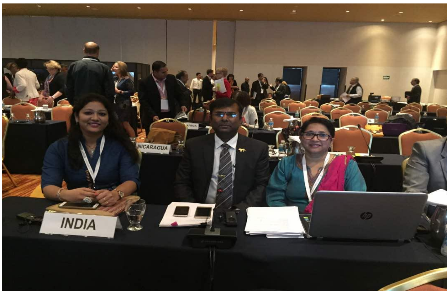
Indian delegation at CCFICS23

The Committee will discuss on the need of work on food integrity and food authenticity, framework for the preliminary assessment and identification of priority areas for CCFICS.