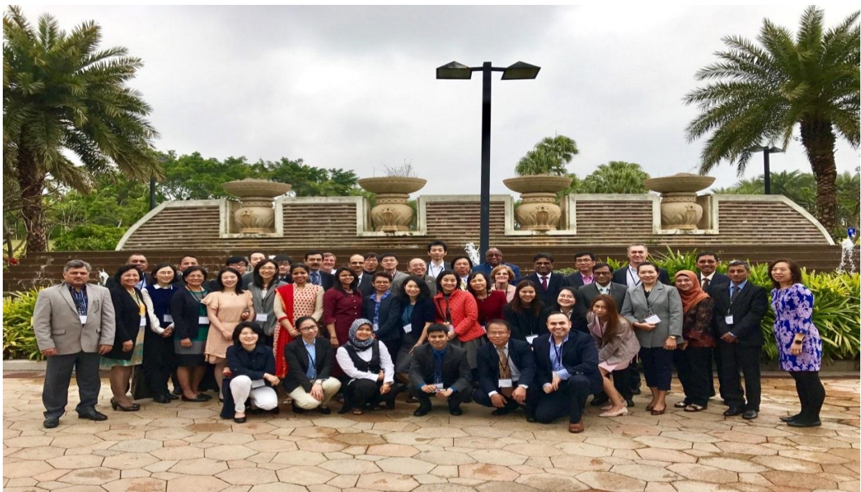
Participants in US-CCASIA Colloquium

13 Asian member countries viz, Bangladesh, Cambodia, China, India, Indonesia, Japan, Laos PDR, Pakistan, Philippines, South Korea, Sri Lanka, Thailand, Vietnam and USA participated in the colloquium.