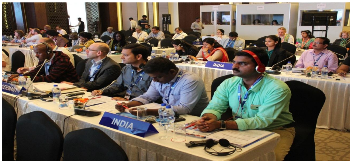
Indian delegation in CCSCH3