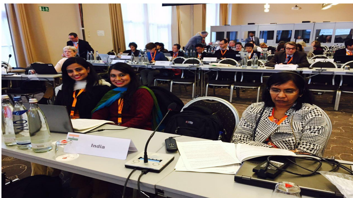
Indian delegation in CCNFSDU 38

special medical purposes intended for infants was forwarded to CCMAS 38 th session for endorsement and also to the 40 th session of CAC for adoption. Also, editorial amendment to the Guidelines on Nutrition Labelling and various CCNFSDU Standards on the use of Flavourings were forwarded to CAC 40 th session for adoption.