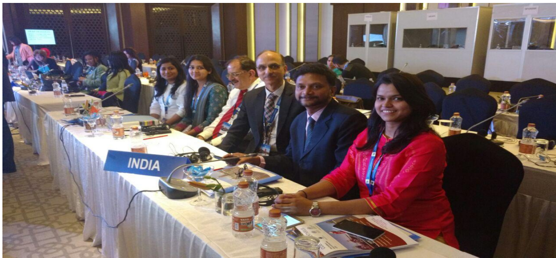
Indian delegation in CCSCH3

and green pepper (Proposed draft). The committee revived following new work proposals subject to approval for 40 CAC: - (dehydrated ginger (India), dried garlic, dried chili peppers and paprika(India), basil, saffron, coriander, nutmeg and cloves.