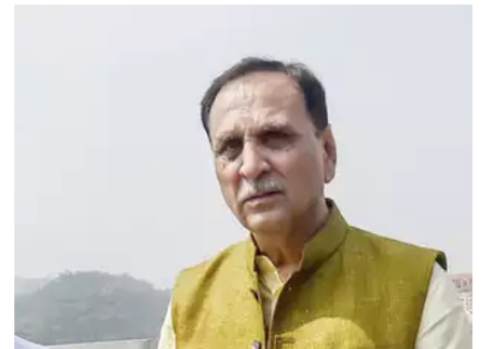
Addressing the gathering on the occasion, Rupani expressed his government's resolve to increase the production of bio-diesel using cooking oil.